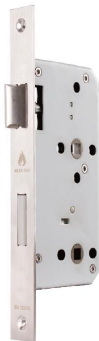
Lockcase Reversible Direction