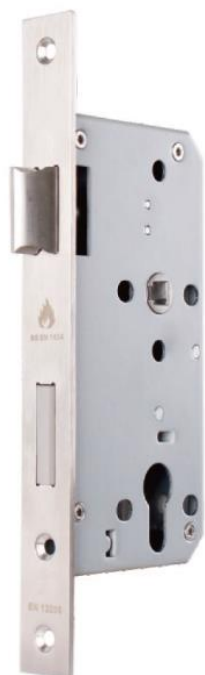
Lockcase Reversible Direction