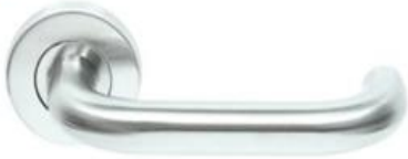
Safety Lever Handle UK-S-LH.881